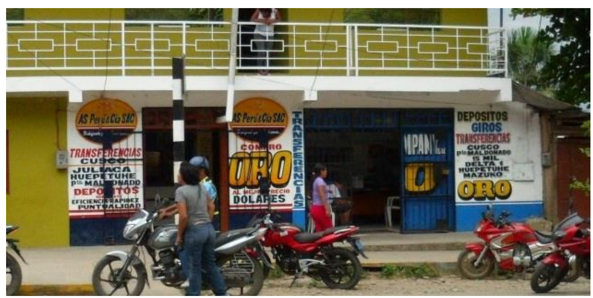
Picture 23 – AS Perú & CIA in Mazuko (Offices in Huepetuhue, Puerto Maldonado, Cusco, Quince Mil, Juliaca)

E & M Company reportedly exported USD 58 million to Switzerland in 2011 and its official office was located in a hotel owned by the mining family mentioned above. The owner of E & M is also reportedly the legal representative of AS Perú & CIA, which exported four tons of gold valued at USD 210 million to Geneva in 2011. In February 2011, the owner of E & M was caught by police outside of the Cusco airport with unlicensed guns, which he claimed were the property of an employee of the company who had recently transported 12 kilos of gold to Lima to be exported to Switzerland. <sup>157</sup> Minera Tambopata, which was owned by an ex-employee of one of the biggest gold exporters based in Puno, exported a half a ton of gold valued at USD 22 million in 2011. <sup>158</sup>