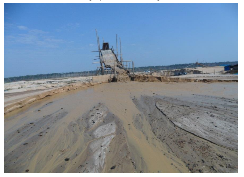
Picture 9 - Chemical Truck Driving Past Mercury-Filled Lake Over 4,000 Feet above Lake Titicaca

In alluvial mining, huge swaths of forest are cleared and burnt and the land is flooded, turning lush tropical rainforests into deserts. In alluvial mining in Madre de Dios, it has been reported that workers have to dig up and sift through 30 tons of rock and sand to find about an ounce of