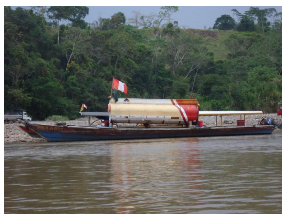
Picture 6 - Boat Transporting Illicit Gasoline to Delta 1, Madre de Dios

Another issue is that the government is rationing gasoline in the mining areas of Madre de Dios to prevent the pumps and backhoes from working. While wealthy owners of large illegal mines easily buy black market gas at a higher cost, workers are faced with more sporadic work schedules (when no gas is available) and higher transportation costs. A round-trip from the city of Puerto Maldonado to a mining area three hours away can cost upwards of USD 100.