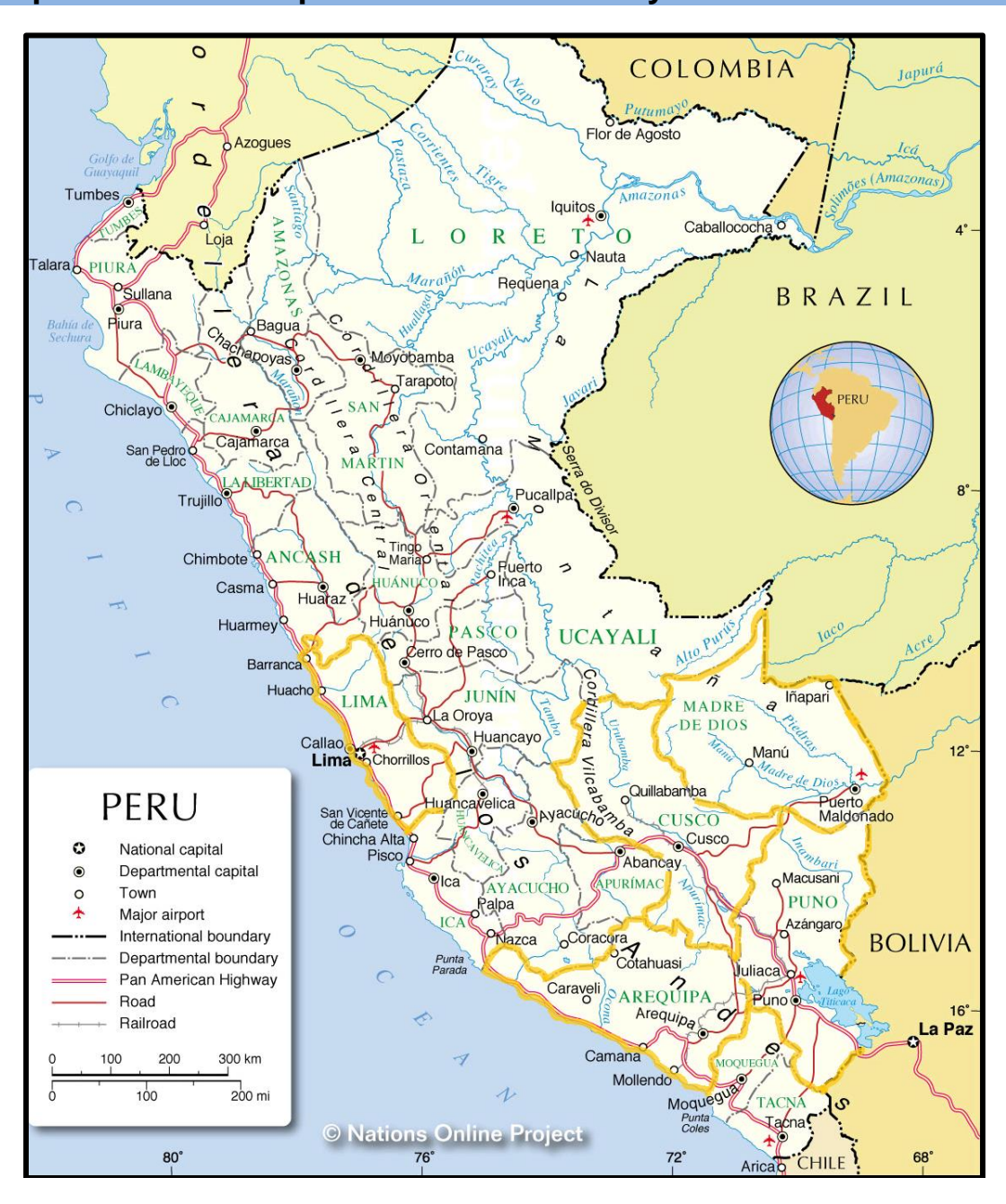
Picture 1 – Map of Peru – Nations Online Project. Peru Administrative Map. http://www.nationsonline.org/maps/peru-administrative-map.jpg