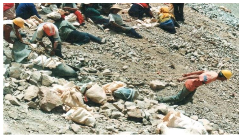
Picture 5 – Artisanal Gold Mining in Arequipa

Miners who are operating on lands that are not protected are considered informal, but may temporarily continue to operate if they are in the process of formalization. During this interim period, informal miners must at least present a "declaration of commitment" to be able to continue mining, selling their gold, and buying explosives legally. However, the government reported that as of February 2013, it had only received 2,700 declarations of commitment and 40 environmental impact certificates (IGAC), a prerequisite to becoming formalized.<sup>33</sup> The government has set a number of deadlines by which informal miners must meet all legal requirements or be declared "illegal," at which point they will be susceptible to criminal charges and sanctions. The government has extended deadlines on several occasions due to widespread protests and threats of roadblocks. The last deadline was set for February 6, 2013 and was extended to October 2013 after threats of widespread protests and roadblocks.<sup>34</sup>