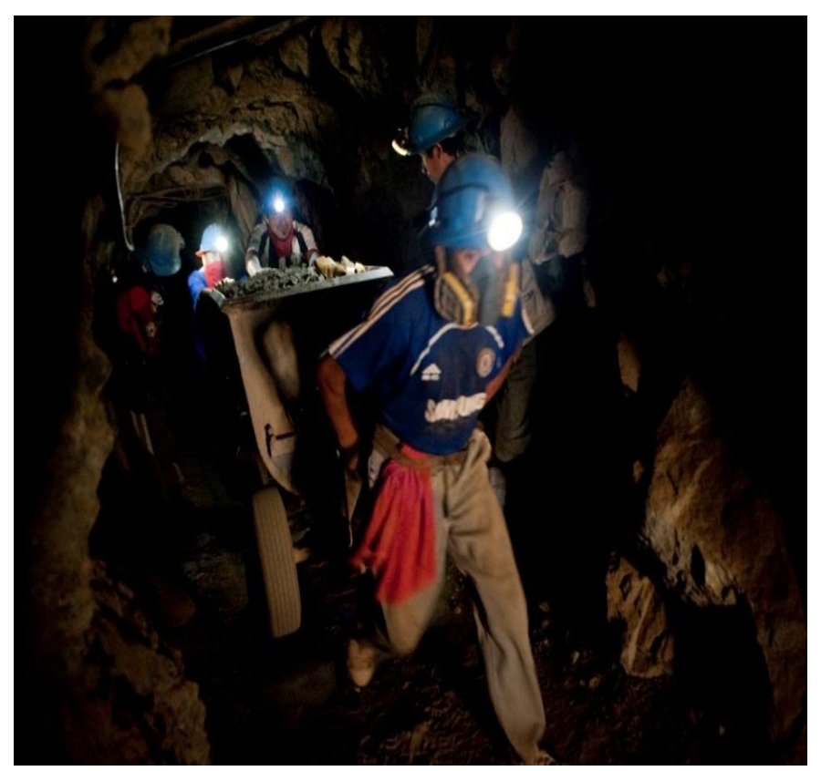
Picture 14 – One of the Mining Cooperatives Exporting Fairmined Gold

Red Social has had a number of success cases. Some of the mines, which just a few years ago used sleds to haul tons of rocks up hills with no PPE and sometimes used child labor, now have sophisticated machinery and PPE, as well as strict standards on health and safety and child labor. Some of the mines even control the whole supply chain, from the extraction of the mineral to the production of their own gold ingots, which they export directly. One of the mining cooperatives, which has 86 members plus additional outside workers, exports gold to France and is establishing a direct relationship with an ethical jeweler in Japan. Another cooperative has 329 members and approximately 120 outside workers. A third cooperative has 180 members and successfully implemented a plan to eradicate child labor. Expert interviews indicate that these mines are more likely to prohibit child labor and provide workers with contracts, PPE, and payment above the minimum wage.