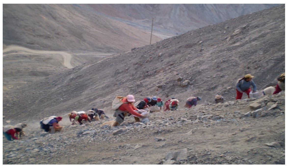
Picture 38 – Female miners ("pallaqueras") in Arequipa

with dismissal. Two women interviewed reported that they had actually been fired for refusing to provide their employers with sexual services.