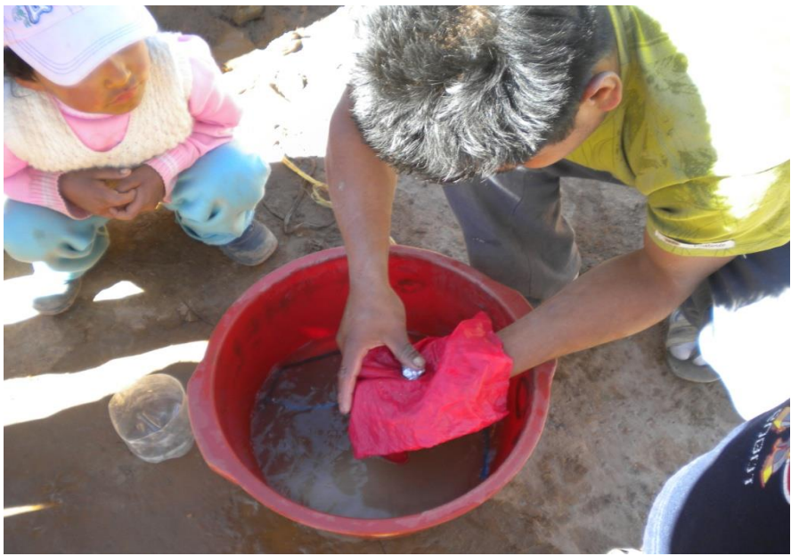
Picture 8 – Man Handling Mercury alongside Girl

Accidents are common in artisanal mining, due to the fact that the ASM is carried out without the benefit of modern technology or PPE and occurs outside of the purview of the law. Additionally, precisely because illegal mines operate outside of the law, workers lack social security and health insurance and accidents are rarely reported. Therefore, many workers and their families receive no compensation if workers are injured or killed on the job. Workers interviewed by Verité reported a large number of fatal accidents, with some workers being buried in unmarked graves without any information or compensation being provided to their family members.