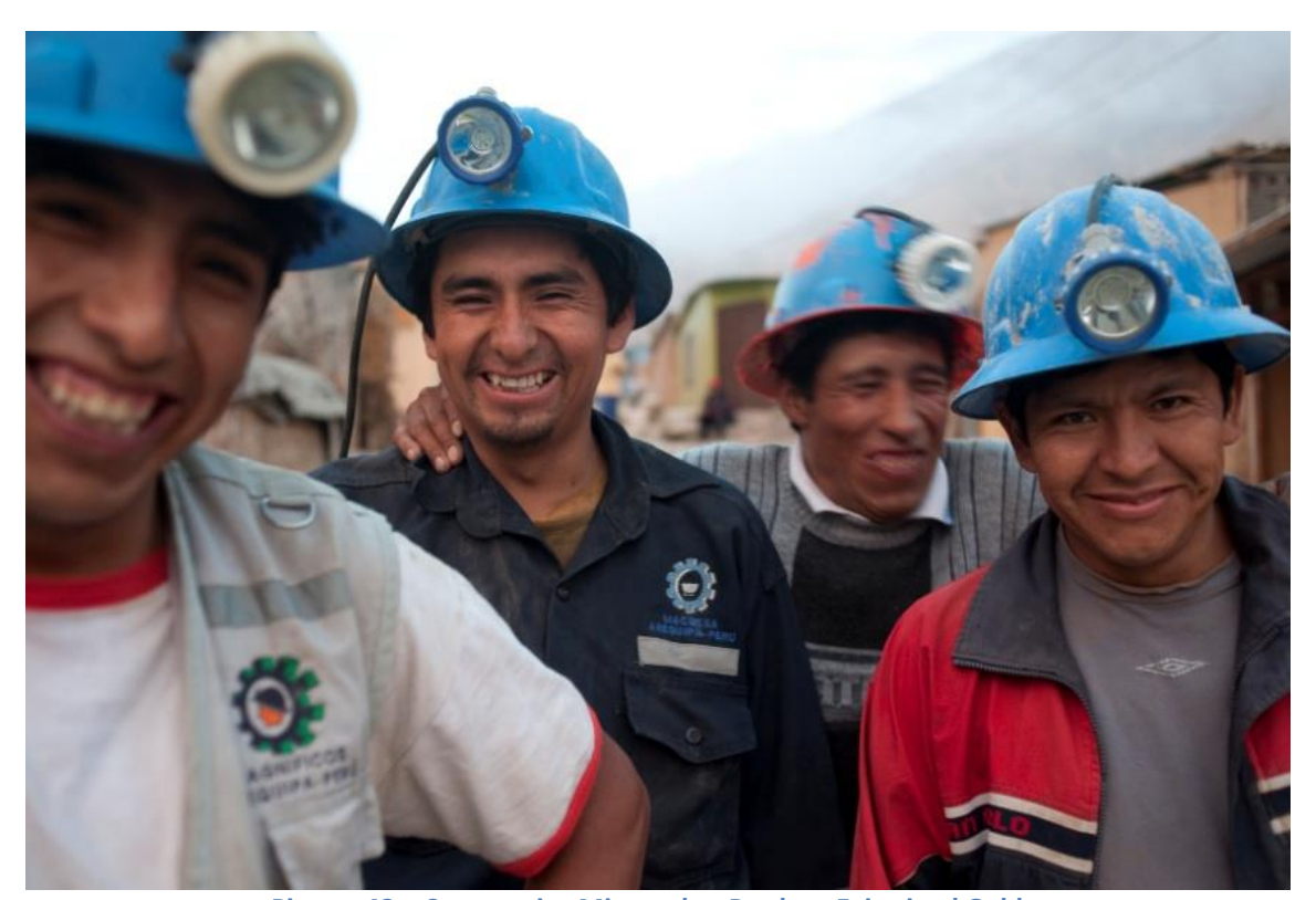
Picture 42 – Cooperative Miners that Produce Fairmined Gold