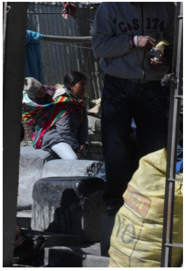
Picture 33 – Woman with Child on Back Working at Quimbalete in La Rinconada

Workers are exposed to mercury during the processing of gold. Each worker is responsible for extracting and processing the gold from the rocks that they mine for themselves. They use an