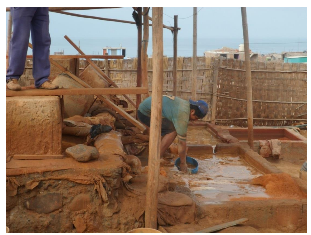
Picture 39 - Worker Handling Mercury-Contaminated Water with Bare Hands at Quimbalete in Chala