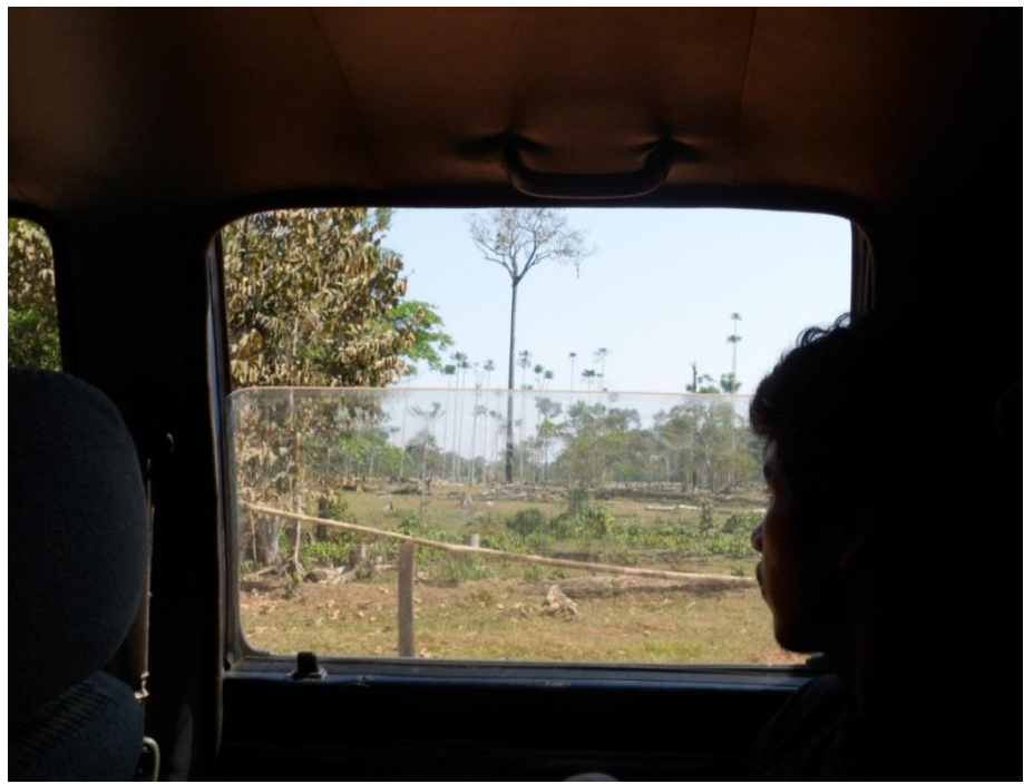
Picture 17 – Machetero Looking Out Window at Forest Cleared for Mining

Among these workers are indocumentados , Peruvians who lack a National Identity Document (DNI). For many indocumentados , the illegal mining sector constitutes their only chance for employment, as formal sector employers require that their workers possess a DNI. In some cases, they are extremely poor, geographically isolated, or indigenous Peruvians who never obtained a birth certificate and have thus been unable to acquire a DNI. These individuals are generally very vulnerable due to their lack of alternative employment and their low levels of education and socio-economic status. In other cases, the indocumentados are criminals or people suspected of having committed a crime who are running from the law and seeking refuge in the lawless environment of the mining camps. Indocumentados may thus be vulnerable to labor exploitation and/or individuals who prey on others as human traffickers, robbers, armed guards, or bouncers at brothels.