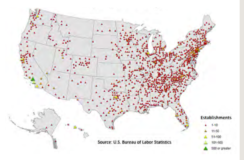
Map taken from the Bureau of Labor Statistics<sup>5</sup>