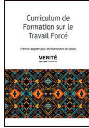
Covers of the Curriculum on Forced Labour developed for different FLIP ToT audiences.