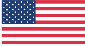
Gift of the United States Government

This report was funded by a grant from the United States Department of State. The opinions, findings and conclusions stated herein are those of the authors and do not necessarily reflect those of the United States Department of State.